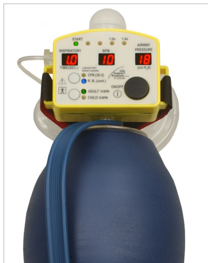
ResusciTIMER shown attached to an LSP L770 adult bag valve mask with the L770-CPR-VEL Velcro® Strap

The ResusciTIMER is an affordable and effective tool for mass casualty preparedness, everyday transport, or training. This simple yet effective device assures caregivers of every skill level that they are providing manual ventilation with perfect technique.