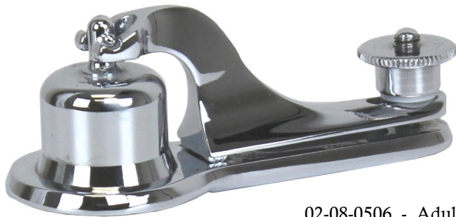
02-08-0506 - Adult