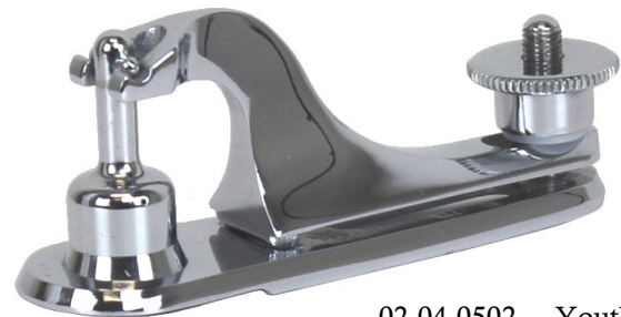
02-04-0502 - Youth