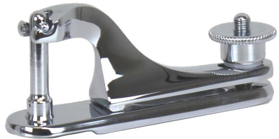
02-00-0500 - Extra Small

The adult circumcision clamp is a modified version of the infant instrument. Different anesthetics and antiseptics are required for adult circumcision.